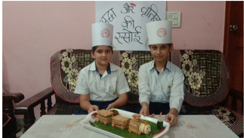
SHRI CHEFS -WINNERS!

ONLY THOSE WHO ATTEMPT, CAN ACHIEVE THE IMPOSSIBLE.